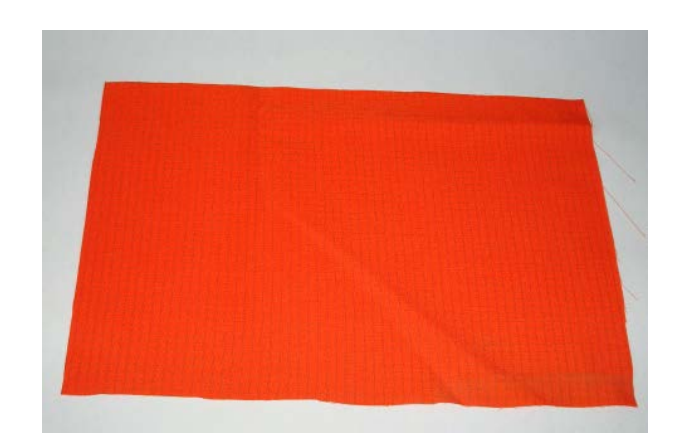
Fig. 3. Sample 1

For the experiment of the stand and method were sampled six samples (360 \pm 2) \text{ mm x} (235 \pm 5) \text{ mm} from antistatic materials (Figure 3,4,5) of different colors used in the manufacture of personal protective equipment. As test liquid was used 96% ethyl alcohol solution – with distilled water in a ratio of 1: 1.