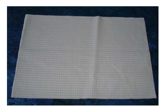
Fig. 4. Sample 2