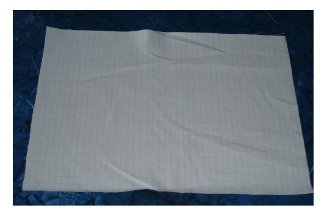
Fig. 5. Sample 3